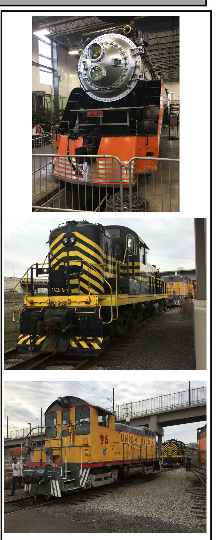
A few images from the Oregon Heritage Railway Museum. A "must visit" museum if you are ever in Portland.

This program is to make better modelers but if you look at the whole program (AP) it also requires you to become an active member in the organization. The more active you become the more modeling friends you will have and enjoy the hobby even more. I know I have. If you've read this far and are still working give this hobby some time, become a limited time active member. When you retire this hobby can take up the time that was dedicated to work, something a retired person needs, staying active.