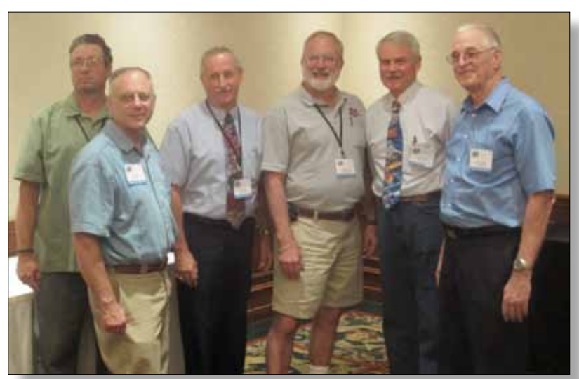
2011 Convention Crew

managed to walk off with my 30 yr old Gulf Mobile and Ohio Atlas RS-3 with a TCS M4 Decoder installed. It has no hand rails, looks great, and runs like a champ. If you happen to see someone having fun with it please let me know. I would like it back!