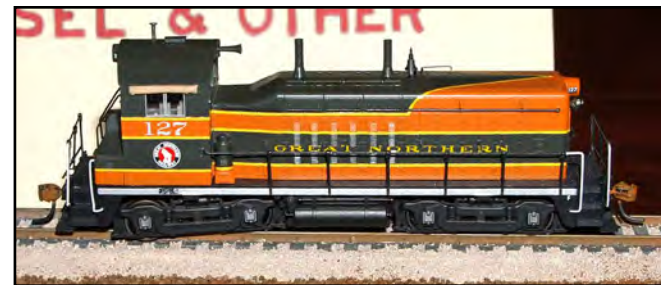
1st Place - Model Diesel Locomotive GN #127 Duane Buck - Arizona