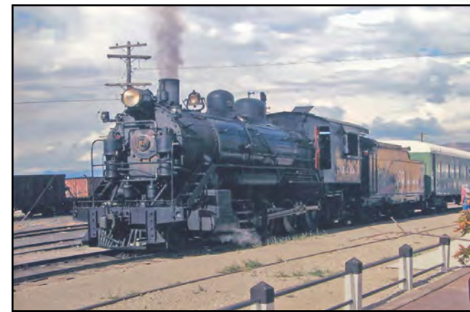
1st Place - Photo Color Prototype #93 At Ely Ken Weber - LA