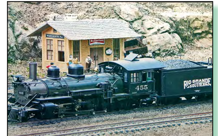
1st Place - Photo Color Model RGS #55 Bob Batt - Arizona