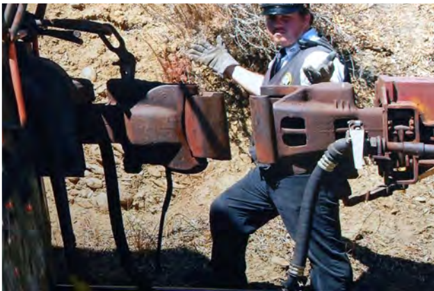
Best in Show - Cajon