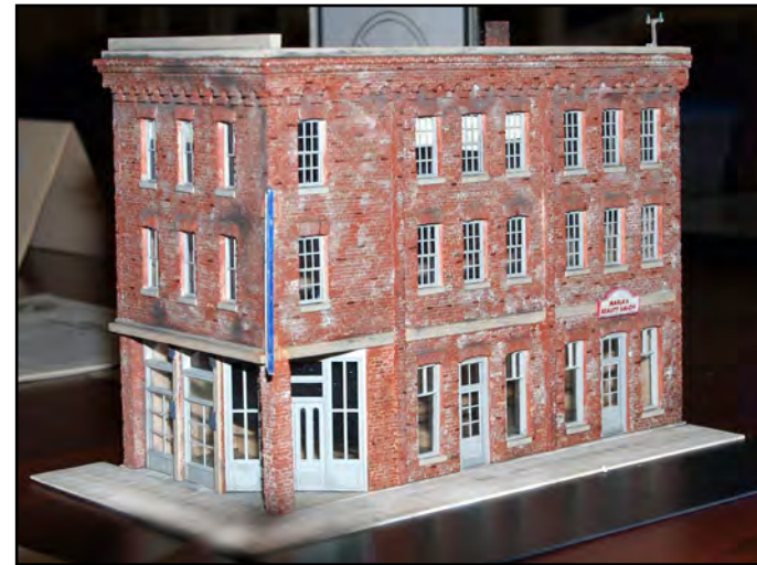
1st Place - Model Structure Off line Butte Merchantile Gary Butts - Cajon