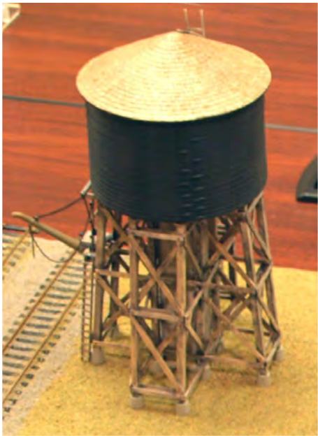
Best of Show - Model Duane Buck - Arizona