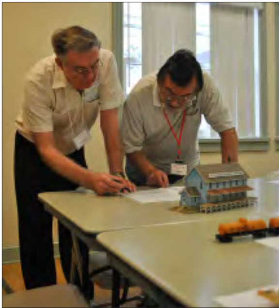
Judging is intense

Whichever afternoon option you chose, everyone gathered at Pat & Oscar's by the Pond for a catered