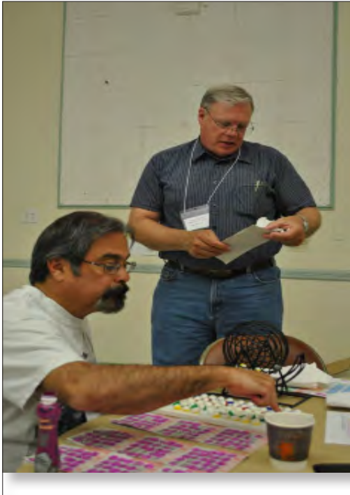
Winning at Bingo

So how many of you have been to a Division Meet outside of your own division? Not many? I totally understand given that our Pacific Southwest Region is so spread out. Of the 4 divisions that make up the PSR – AZ, Cajon, LA and San Diego – no two are closer than a 4-5 hour trip one way. That means an overnight stay and more money taken from the train-budget.