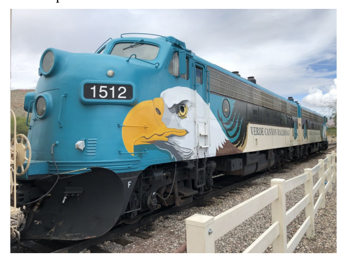
FP7 diesel electric locomotives—only 2 of 10 remaining

the beautiful mountains of Arizona near Sedona. The railroad traverses about 20 miles of relatively inaccessible red-rock terrain following the Verde River between Clarkdale and Perkinsville. The day had perfect weather with pleasant 80 degree temperatures and beautiful partly cloudy skies. Our group had a reserved parlor car all to ourselves as well as access to an open air observation car. Perkinsville has a