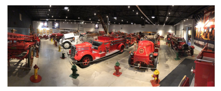
Just one of several museum display rooms

Another exceptional outing was the ride on the Verde Canyon Railroad following the Verde River through