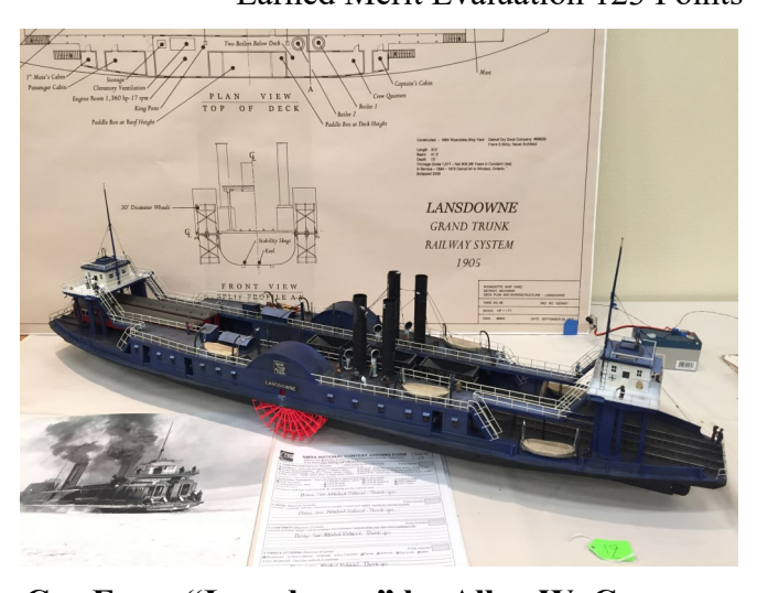
Car Ferry "Lansdowne"