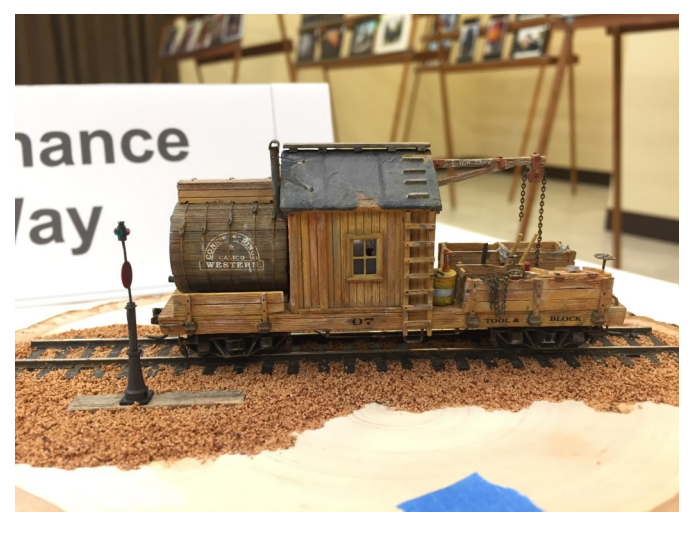
CS/CW Work Car