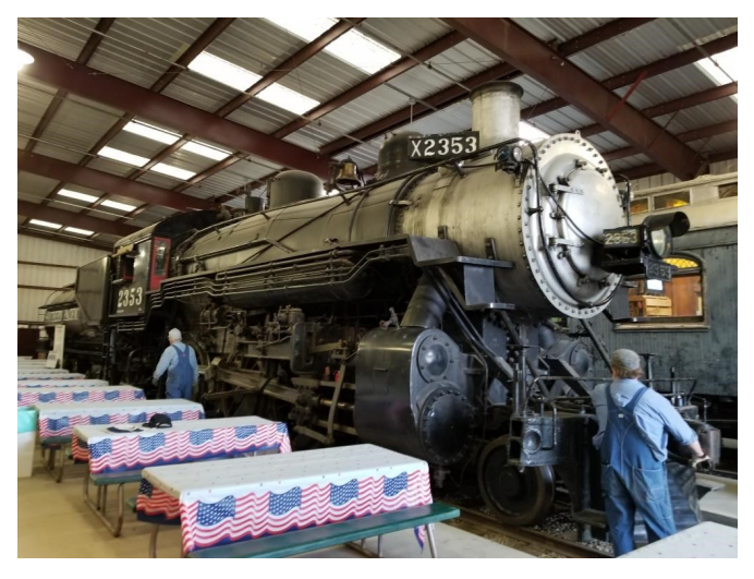
Southern Pacific 2353

The museum certainly had a lot of activities. There were train rides, antique cars, antique fire apparatus, presentations, reenactors, and all the equipment the museum has to offer. There was a catered lunch, but tickets needed to be purchased in advance. A PSR San Diego member and Campo Museum member chartered the Santa Fe Café-Lounge Observation 1509.