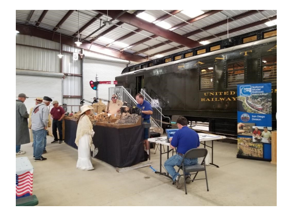
SD Division N-Scale layout display