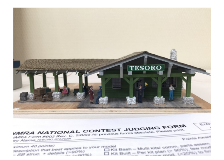
Tesoro Station by Gary Butts