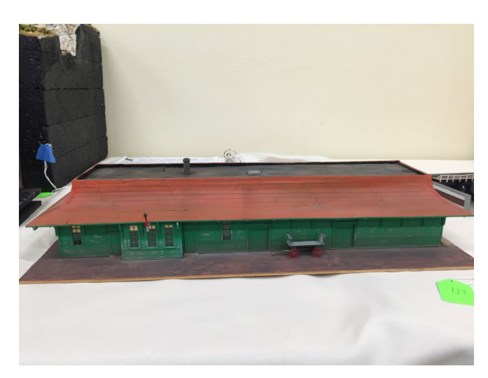
M & St.L Passenger & Freight Depot