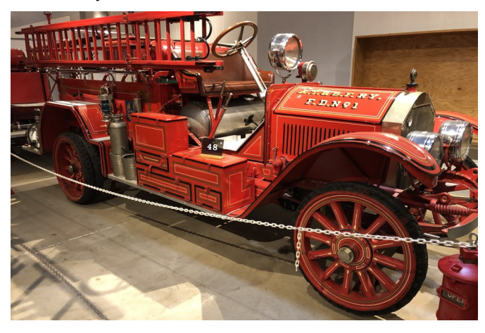
AT&SF Hose and ladder truck

The Hall of Flame, while not specifically a RR attraction has the largest collection of fire fighting apparatus in the world, with over 90 fire fighting vehicles on display. They have a Santa Fe hose and ladder truck on display which was only one of a multitude of beautifully restored vehicles.