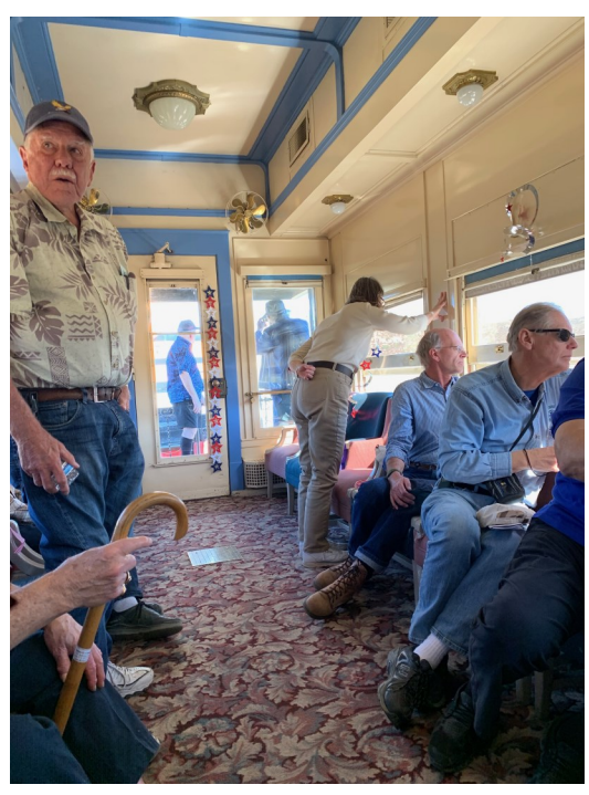
Santa Fe observation Car 1509