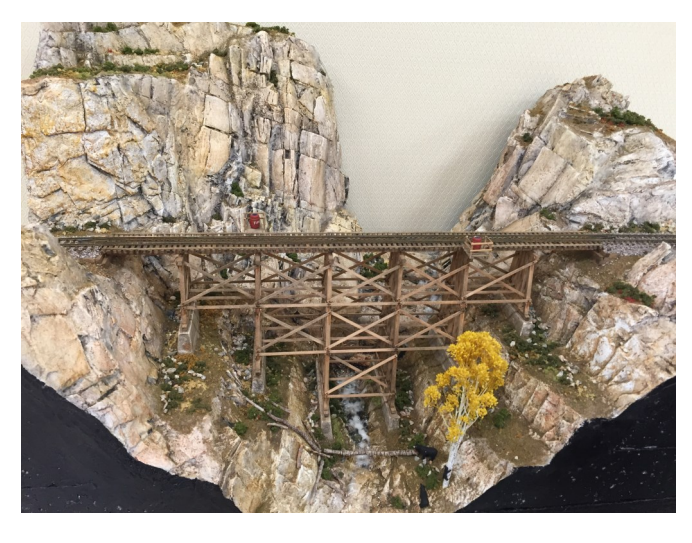
Bear Creek Trestle