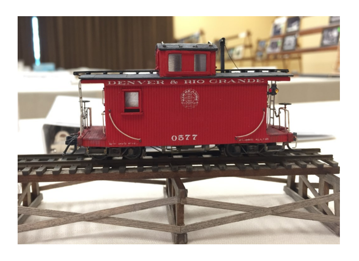
D&RGW Short Caboose # 0577